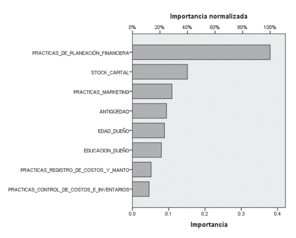
Figure 2.Standardized importance of each factor

On the other hand, the age of the organization on the market takes 4th place in terms of importance to explain sales. Given the characteristics of the analyzed segment (microenterprises), the average age of the sample is relatively low (just over 3 years), which suggests that companies are located in early stages of the learning curve, so that small differences in time on the market can represent important learning distances, as is also validated by the econometric analysis.